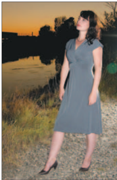
Hilary dress by Narcissist ($149) available at Narcissist boutiques (3659 Main St. and 102-1548 Johnston Rd. in White Rock).