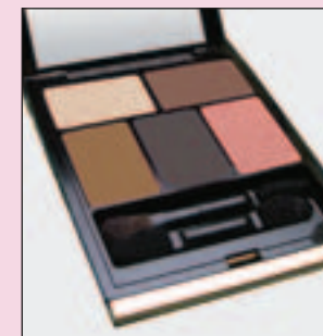
Kebyn Aucoin Essential Eyeshadow Set ($66) and Kimiko Beauty Sheer Tint and LipPLUMPER ($40). Both available at BeautyMark (103-1120 Hamilton St. in Yaletown).